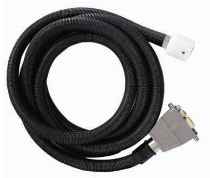
Bacchus foodgrade silicone hose