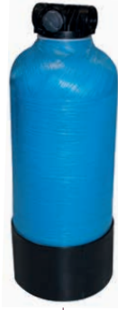
Water softener cartridge with resins for consumption up to 800 liters