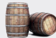
BARREL ROOM up to 50 barrels*