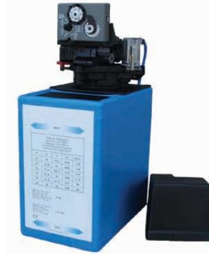
Water softener with automatic regeneration of resins through sodium chlorite for consumption above 800 liters