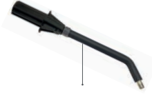
45° curved bayonette lance