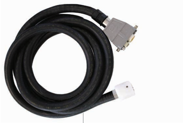
Bacchus foodgrade silicone hose