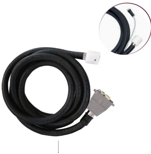
Bacchus foodgrade silicone hose with or without pressure switch connection 4m - 8m - 10m