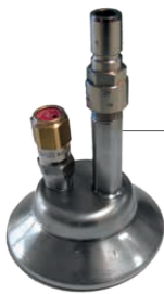
GAROLLA Ø 40mm - Ø 50mm - Ø 60mm