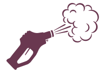
CLEANING OF EQUIPMENT