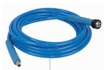
High pressure water hose 10m