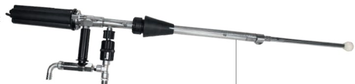
High pressure cleaning rod for barrels Ø730mm, with steam + vacuum + high pressure water