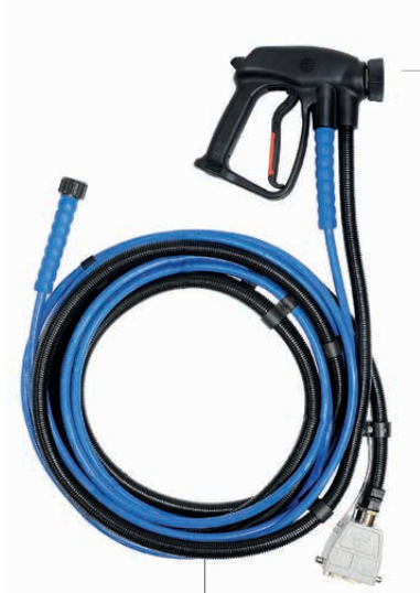
Geysir 2 hose 10bar-150bar steam & water