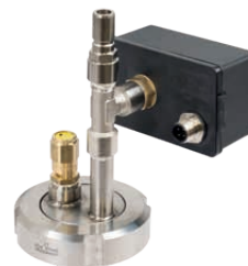
DIN with safety valve Ø 32mm - Ø 40mm - Ø 50mm - Ø 60mm