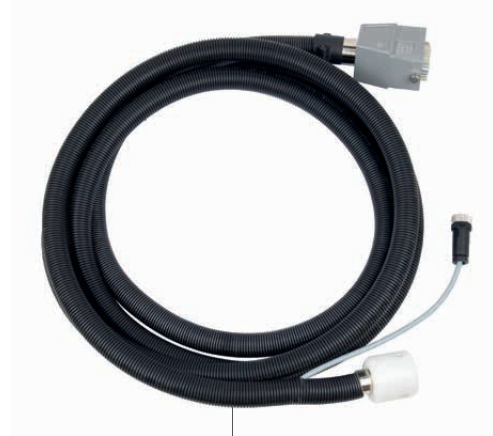
Bacchus foodgrade silicone hose predisposed for pressure switch connection