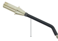
45° curved bayonette lance