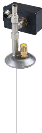
GAROLLA connections with a mechanical safety valve PED approved Ø 40mm - Ø 50mm - Ø 60mm