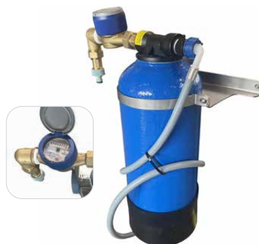
Standard kit water softener Stainless-steel holders + liter counter + water softener cartridge with resins* *for consumption up to 800 liters