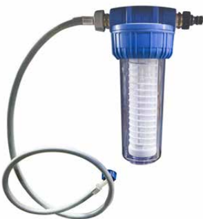
Kit water purifying Stainless-steel holders + external water purifying filter