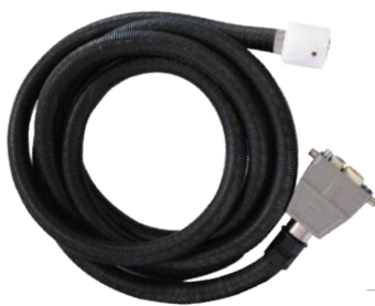
Bacchus foodgrade silicone hose 4m - 8m - 10m