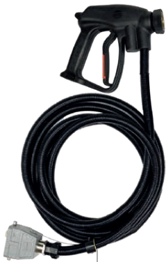
Hose 5m - 8m - 10m - 15m