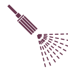
High pressure water