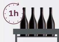
BOTTLING LINE up to 5.000 bottles*