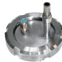
DIN connections with a mechanical safety valve PED approved Ø 32mm - Ø 40mm - Ø 50mm - Ø 60mm