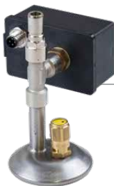
GAROLLA with safety valve Ø 40mm - Ø 50mm - Ø 60mm