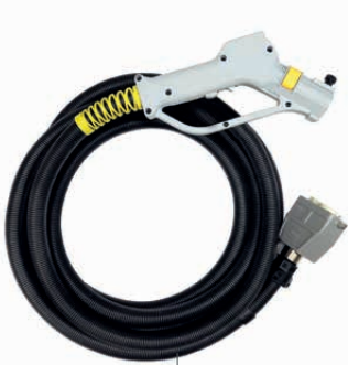
Hose 5m - 8m