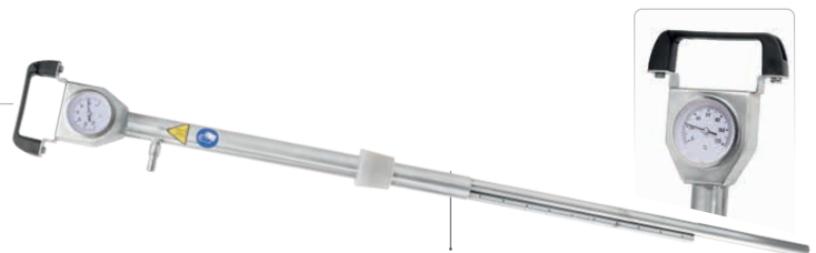
Steam diffuser with thermometer for checking the actual temperature inside the barrel