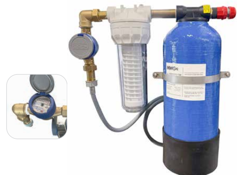
Complete kit water softener Stainless-steel holders + liter counter + water softener cartridge with resins* + filter *for consumption up to 800 liters