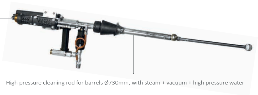
High pressure cleaning rod for barrels Ø730mm, with steam + vacuum + high pressure water