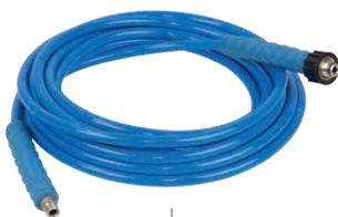
High pressure water hose