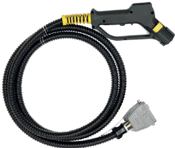
Hose 3m - 5m