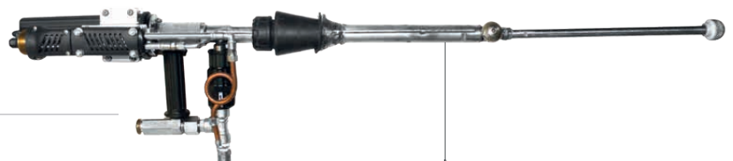
High pressure cleaning rod for barrels Ø730mm