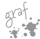
GUM & GRAFFITI REMOVAL