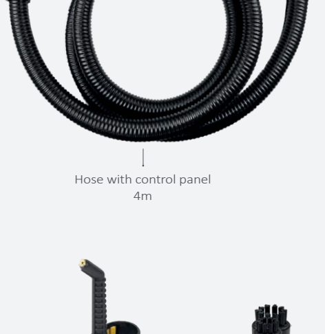
Nylon brush Ø28mm