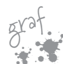
GUM & GRAFFITI REMOVAL